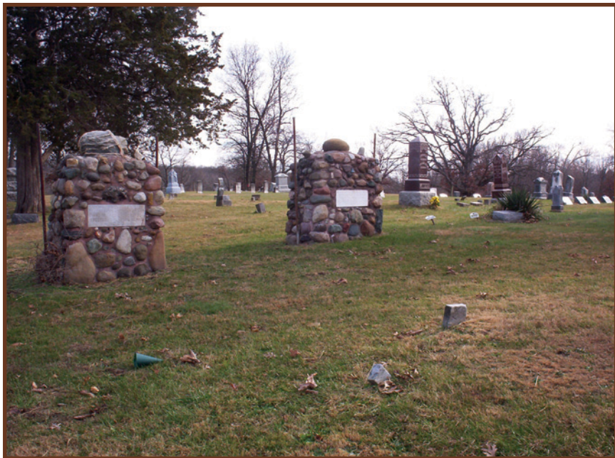
Chockley Cemetery, #5, Southeast Loop