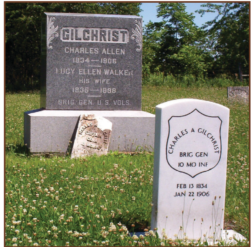
Arberghast-Pearce Cemetery, #2, Northeast Loop Brigadier General Charles Gilchrist, Civil War